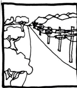
SMALLER IN DISTANCE LARGER CLOSER UP