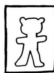
NEGATIVE SPACE the "empty" space around the subject or objects