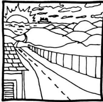
FILL THE WHOLE PAPER