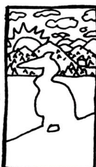
BACKGROUND (far space)