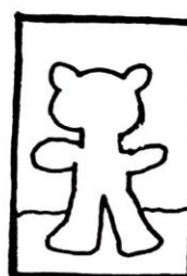
POSITIVE SPACE the objects or subject in the work of art, not the space around them