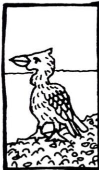
FOREGROUND (near space)