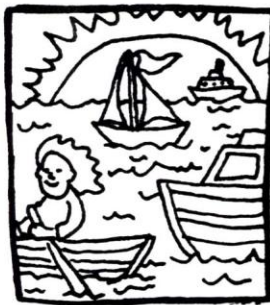
PLACEMENT IN RELATION TO HORIZON