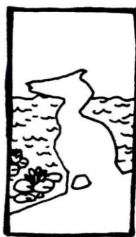
MID GROUND (middle space)