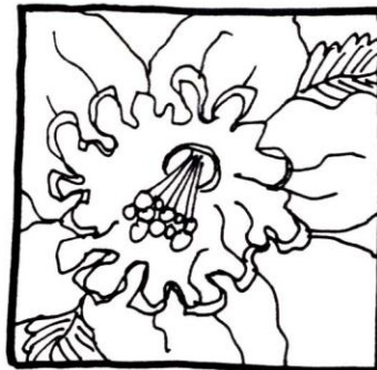
LINES OFF THE PAPER