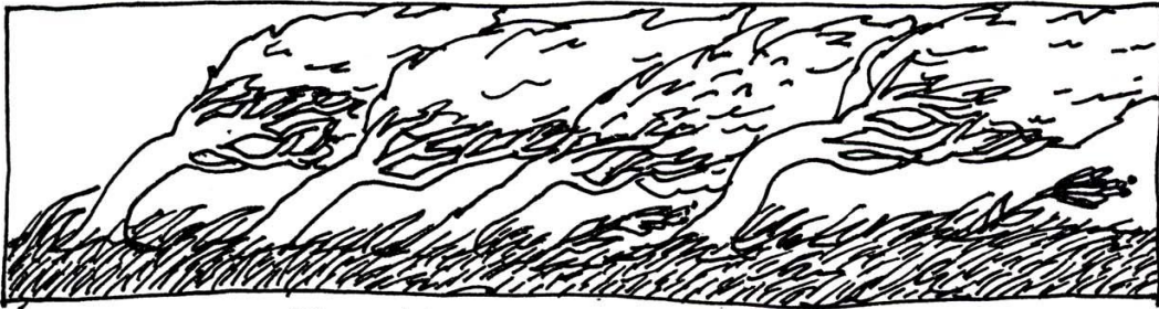
Trees blowing in the wind...

A REGULAR REPETITION OF THE ELEMENTS OF ART CAN CREATE A SENSE OF MOVEMENT/RHYTHM.