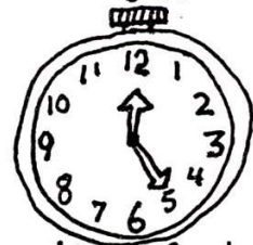
The ticking of a clock is rhythm.