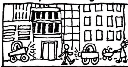
The city has a rhythm.