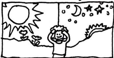
The day has a rhythm to it. Sunrise... sunset... Sunrise... sunset...