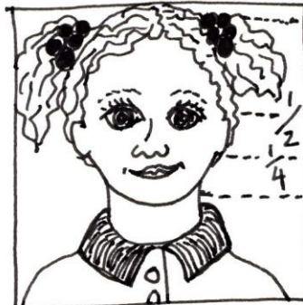
Proportions of the head