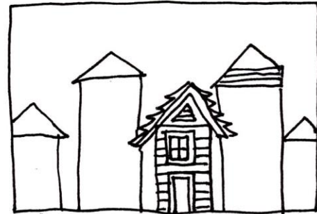
A house that stands out from the rest