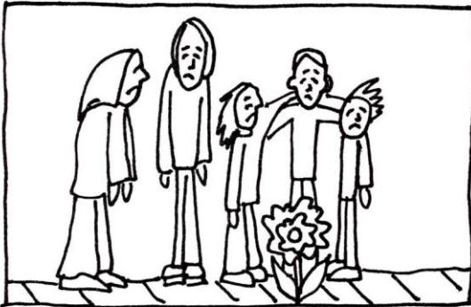
A beautiful flower growing in a grey, dismal setting.

FOCUS-MAIN IDEA-WHAT "GRABS" MY ATTENTION?